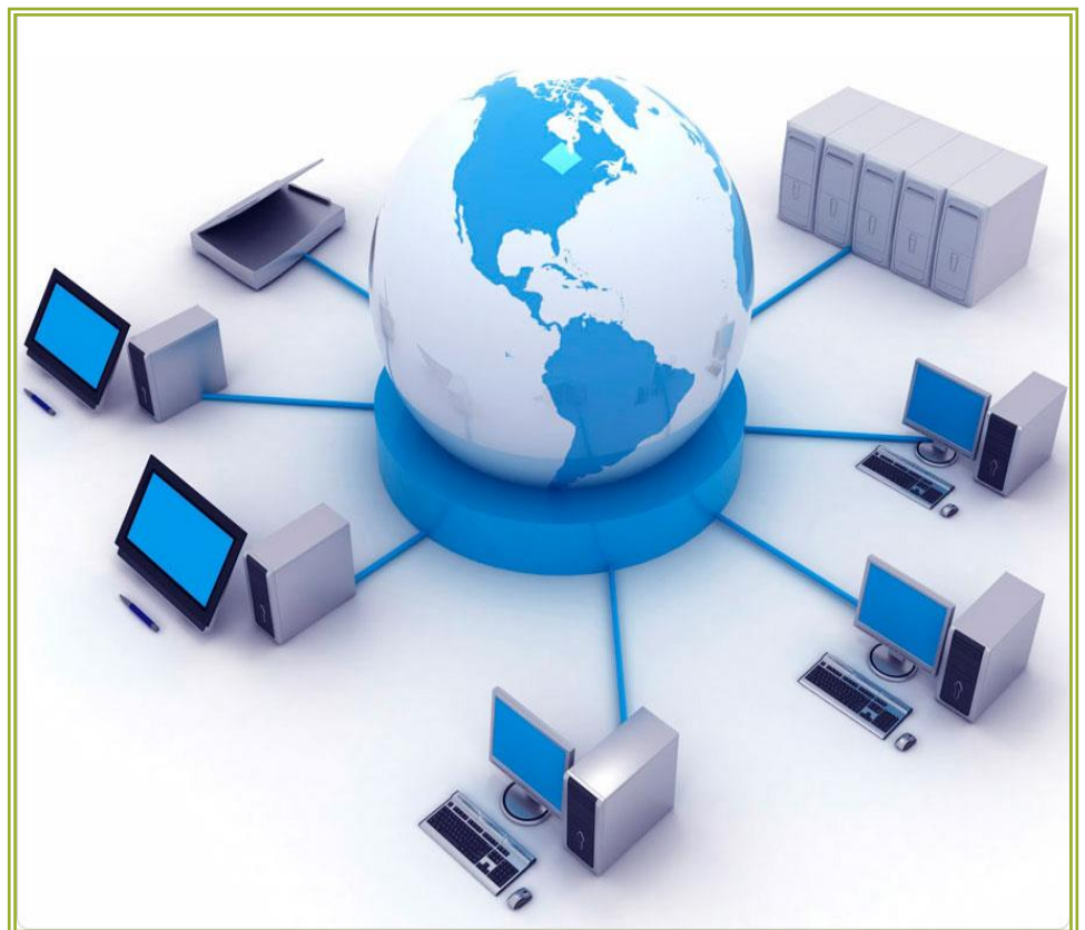
FineDocs Centralized Knowledge / Information Repository

Acyutah's FineDocs Document Management system will facilitate the organization to Store, Manage & Archive the documents as and when required as per the organization's rules. Acyutah Document Management System – FineDocs helps multiple departments of the organization like, HR, Admin, Accounts, Quality, Inventory etc. to create knowledge based of all the information / Documents available with role based user access over the same. FineDocs is a Web based application which can be accessed from any location throught the globe using any standard browser.