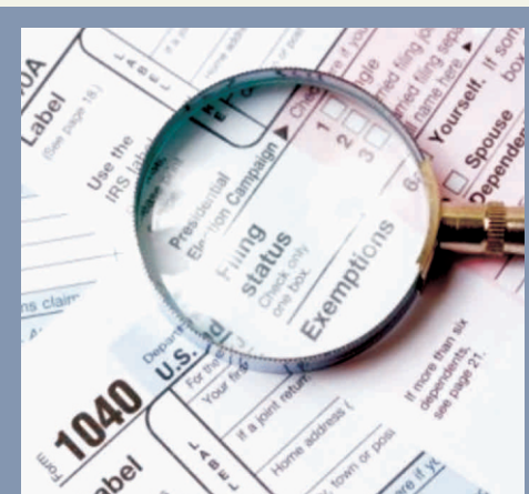
Efficient search for your information with the Powerful FineDocs Crawler

Now that the Information is searchable and synchronized for you, we want you to enjoy your time and enjoy the world of technology!